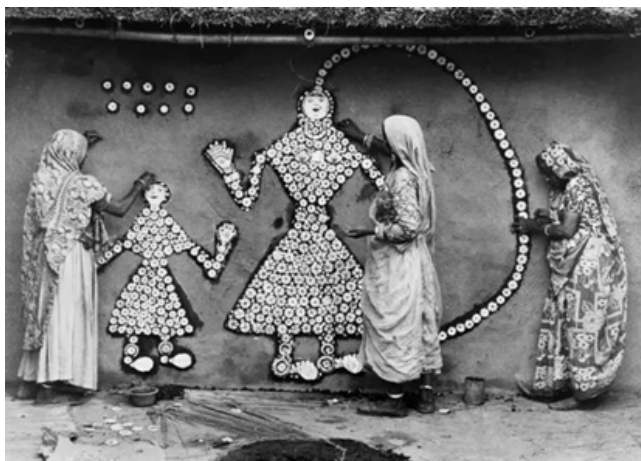
Fig.11: Women of northern Haryana state creating a mural painting, 1977.