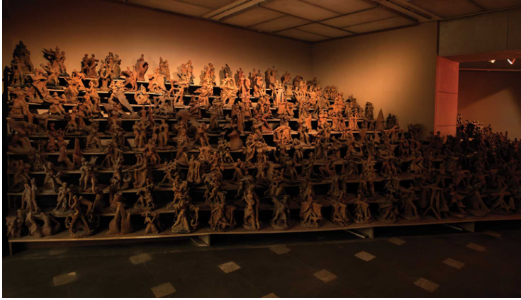
Fig.13: One and the Many, 409 terracotta figurines, 2015 by Vivan Sundaram

Vivan Sundaram's The installation features photographs, archival materials, and everyday objects arranged in a way that blurs the boundaries between art, history, and craft. Sundaram's use of materiality reflects K. G. Subramanyan's influence, particularly his emphasis on integrating artistic practice with craftsmanship. By repurposing found objects, Sundaram creates a dialogue between the past and the present, exploring the ways in which tradition is preserved, transformed, and remembered. Sheikh's works often reference Indian miniature painting, Sufi poetry, and Mughal art while engaging with contemporary issues. He transforms this folk tradition into a modern visual narrative, exploring themes of urban life, memory, and identity. Sheikh's layered compositions, rich with symbolic references and storytelling, reflect Subramanyan's teachings on reinterpreting tradition for contemporary relevance.