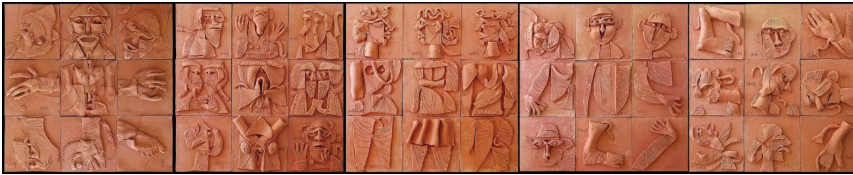
Fig.2: Anatomy Lessons, 2006 by K. G. Subramanyan

By starting at the “branches” – the diverse expressions and practices of tradition visible today – Subramanyan encourages exploring how these practices emerged, what influenced them, and how they remain connected to their origins (“roots”). This reverse exploration allows for a deeper understanding of the continuity and adaptability of tradition, recognizing it as a living, evolving entity rather than a static framework. In the realm of art, this philosophy implies that an artist does not merely replicate traditional forms but reinterprets them in light of present-day realities. For instance, an artist might look at the contemporary manifestations of folk art or mythology (the branches) and delve into their historical and cultural origins (the roots). Through this process, the artist can create something that is both authentic and innovative, blending the essence of tradition with modern sensibilities.