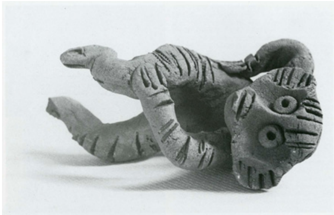
Fig. 4: Toy designed for the Fine-Arts fair Fine Arts Fair, Baroda, 1968.