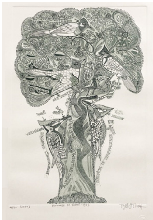
Fig.10: Homage to Iqbal, Etching, 1985 by Jyoti Bhatt

meticulous craftsmanship of woodcut printing reflects Bhatt's respect for indigenous techniques, while his modern compositions give these traditions a contemporary edge. Bhatt's use of strong lines, bold contrasts, and simplified forms aligns with the aesthetic of folk art, creating a visual language that is both timeless and modern. In addition to his prints, Bhatt's photographs of rural art document ephemeral practices such as wall paintings, rangoli, and mud relief work created by rural artisans. These photographs are not mere records but artistic interpretations that celebrate the creativity of India's rural communities. By capturing these art forms, Bhatt preserves their cultural significance and elevates them to the status of fine art. Bhatt's work reflects K. G. Subramanyan's teachings on the importance of integrating tradition into contemporary art. Subramanyan's belief in the vitality of folk and craft traditions inspired Bhatt to engage deeply with rural art forms, both as a source of inspiration and as a subject of documentation.