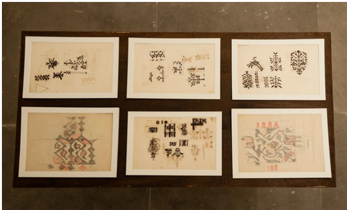
Fig. 7: Untitled, 1959-1961, Ink on Paper by K. G. Subramanyan for Weavers' Service Centre

Additionally, the boundaries between "fine art" and "craft" were deeply entrenched, often marginalizing the contributions of artisans. The collaboration aimed to challenge these hierarchies by bringing artists and craftspeople together, recognizing the artistry of handloom weaving, and encouraging innovation within traditional practices. By engaging with artists, the Weaver's Service Centre aimed to modernize design and make handloom products more appealing to contemporary tastes, ensuring their relevance in a changing world.