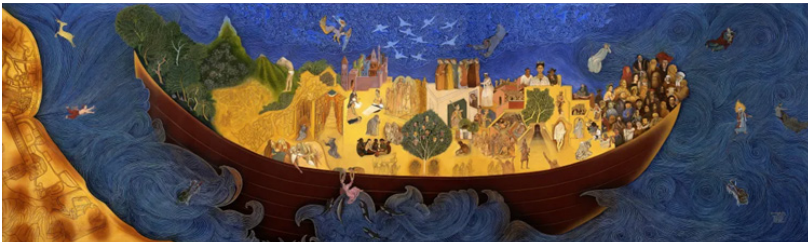
Fig.14: Kaarawaan and other stories, 2024 by G. M. Sheikh

Vivan Sundaram's The installation features photographs, archival materials, and everyday objects arranged in a way that blurs the boundaries between art, history, and craft. Sundaram's use of materiality reflects K. G. Subramanyan's influence, particularly his emphasis on integrating artistic practice with craftsmanship. By repurposing found objects, Sundaram creates a dialogue between the past and the present, exploring the ways in which tradition is preserved, transformed, and remembered. Sheikh's works often reference Indian miniature painting, Sufi poetry, and Mughal art while engaging with contemporary issues. He transforms this folk tradition into a modern visual narrative, exploring themes of urban life, memory, and identity. Sheikh's layered compositions, rich with symbolic references and storytelling, reflect Subramanyan's teachings on reinterpreting tradition for contemporary relevance.