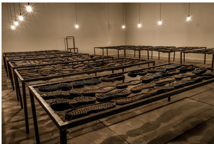
Fig.12: 12 Trash series 2008 Bed Ward 03 by Vivan Sundaram