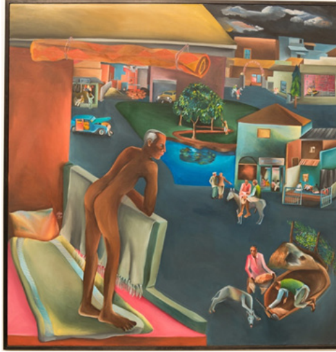
Fig.9: You Can't Please All, 1981 by Bhupen Khakhar

In works like “You Can’t Please All” (1981), Khakhar combines elements of Indian miniature painting with bold, modern compositions. The painting narrates a story inspired by a traditional fable while portraying a deeply personal and contemporary theme of identity and vulnerability. Khakhar’s use of bright colors, flattened perspectives, and symbolic imagery reflects his connection to folk art and his teacher’s emphasis on tradition as a living, adaptable force.