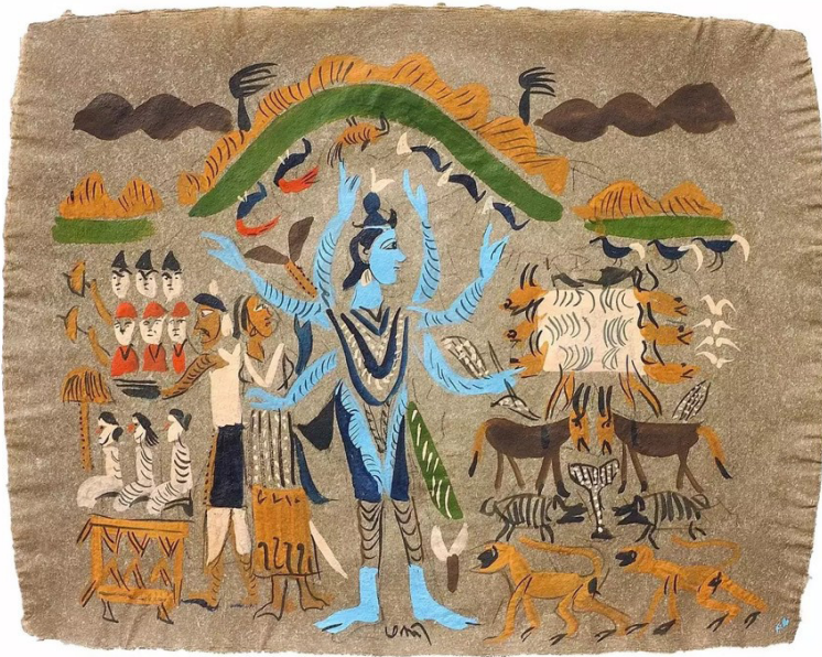
Fig.1: Untitled, Water colour on Ramie paper by KG Subramanyan

His perspective on living traditions was deeply influenced by his experiences in Santiniketan, where he studied under the guidance of luminaries like Nandalal Bose, Benode Behari Mukherjee, and Ramkinkar Baij. Santiniketan's pedagogical emphasis on integrating traditional Indian art forms with contemporary practices aligned with Subramanyan's views. He also drew inspiration from folk and craft traditions, particularly from rural India, which he saw as rich repositories of cultural knowledge and artistic ingenuity. Subramanyan's artistic practice exemplified his philosophy. His works often blended diverse elements: the visual vocabulary of Indian folk and tribal art, the narrative depth of mythological stories, and the experimental techniques of modernism. His murals, paintings, and terracotta reliefs combined bold stylization, intricate patterns, and vivid storytelling, creating a language that was uniquely his own yet deeply rooted in Indian artistic heritage.